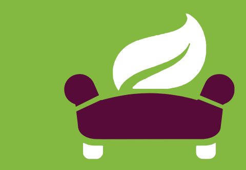
"Where Creativity Meets Living"

With us you will have access to all your home interior needs from furniture, curtains, mattresses, pillows, beddings, pieces of art, towels, kitchen accessories and many more.